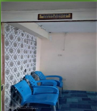
ENTRANCE INTO MISSION DIRECTOR'S OFFICE.