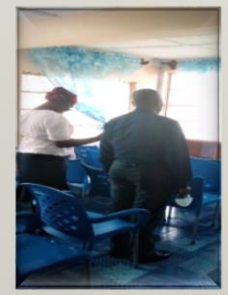
DEDICATING THE MISSION OFFICE TO GOD (03 JUNE, 2020)