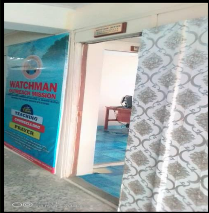
ENTRANCE INTO THE MISSION OFFICE.