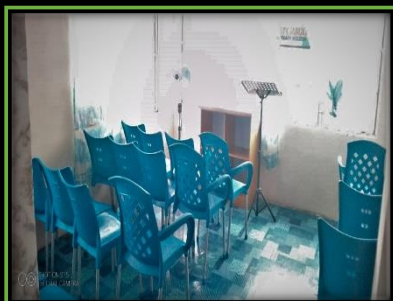
LECTURE AND TRAINING ARENA