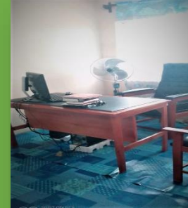
MISSION DIRECTOR/ADMINISTRATOR'S DESK