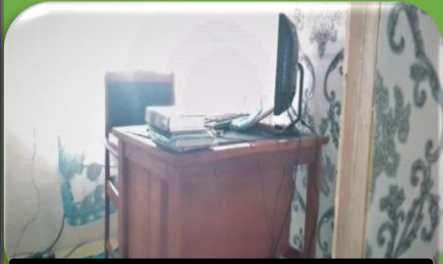
MISSION OFFICE SECRETARY'S DESK