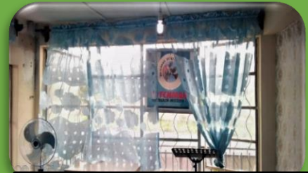
LECTURE AND TRAINING ARENA (front view)

"Those who labour in faith shall not labour in vain"